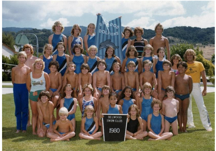
1980 Team Photo