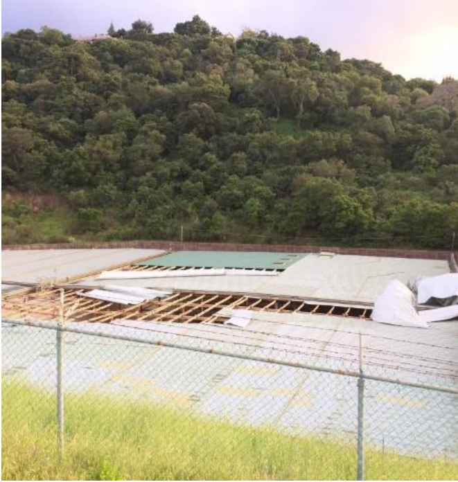
FIGURE 1. THE EARTHEN EMBANKMENT RESERVOIRS BEFORE THEIR REMOVAL.

Most of you have probably noticed the heavy truck traffic in the neighborhood to and from Belgatos Park that has been going on for about three years.