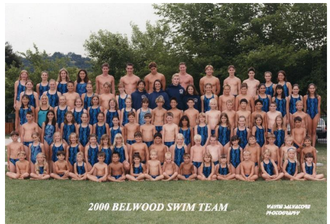
2000 Team Photo