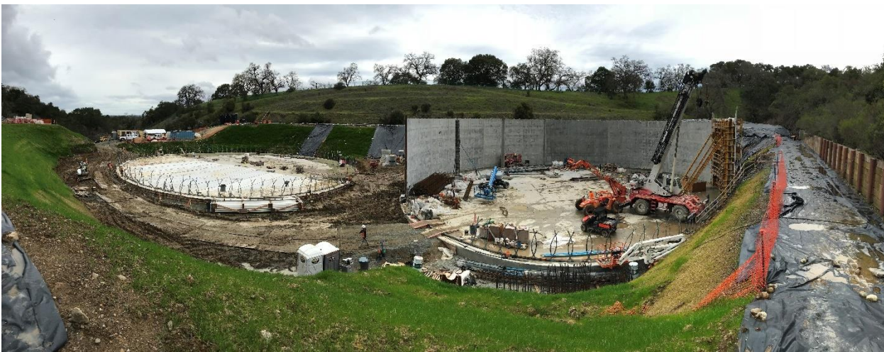
FIGURE 2. EARLY CONSTRUCTION PHASE OF THE REPLACEMENT TANKS. HERE YOU SEE THE TANK ON THE RIGHT WITH HALF OF THE SIDE ELEMENTS INSTALLED.

The storage volume of the earthen reservoirs was larger than the demand in the Belgatos pressure zone. SJW's Engineering Department conducted a complete analysis to determine the storage capacity necessary to serve the system with the new tanks – taking into consideration many factors such as operational needs (zone inputs and additional storage capacity), water quality (water age), and usage demands (with population forecasting) – and concluded only about half the storage capacity is necessary to serve the zone.