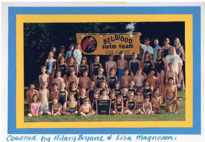
1990 Team Photo