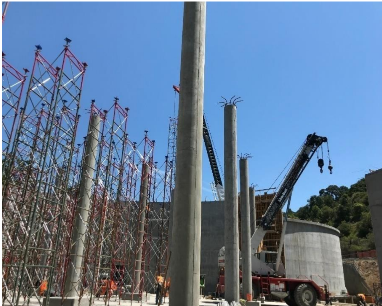
FIGURE 3. COLUMNS INSIDE A TANK.

Other considerations in the project are the more stringent building standards that exist now plus resilience to possible earthquakes.