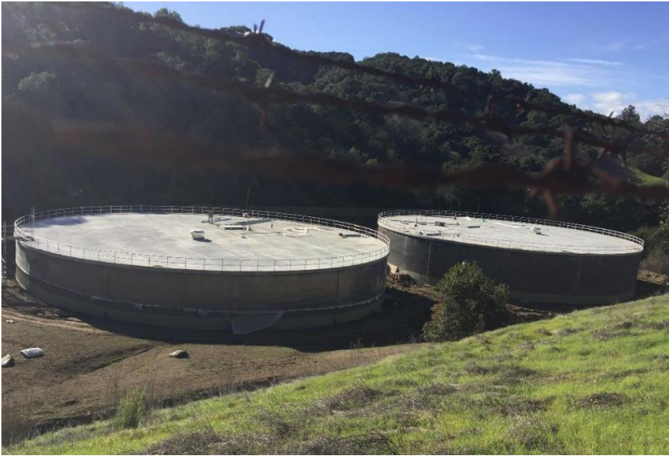
FIGURE 4. THE ALMOST COMPLETE TANKS.

No additional work is needed that requires digging up the streets. However, repairs to the street in a few locations that were damaged by construction traffic will be done. The Town of Los Gatos is aware of these locations and agreed that waiting until the end of the project was the best course of action to prevent re-damaging any repairs made. The project is on target to complete by June 2020, significantly earlier than December 2020 originally anticipated.