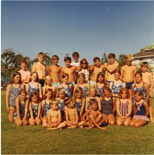
1971 Team Photo